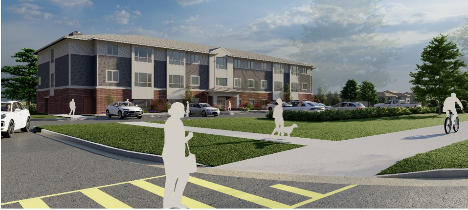
CONCEPTUAL IMAGES: Grace Terrace Rendering from S. Arlington Heights Rd. Looking SE